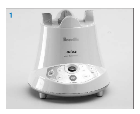
Step 1. Place the motor base on a flat, dry surface such as a bench top. Ensure that the motor base is switched OFF at the power outlet and the power cord is unplugged.